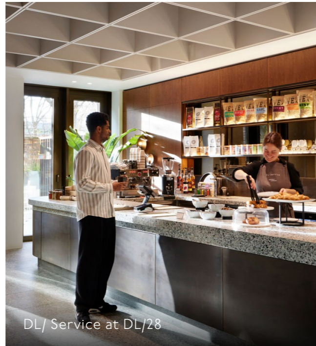
DL/ Service at DL/28

Members also have access to a packed calendar of experience-led events curated by our dedicated team. And the DL/ App is your effortless personal portal to all of it.