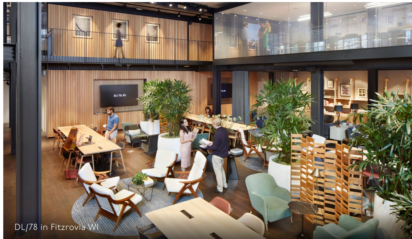
DL/78 in Fitzrovia W1