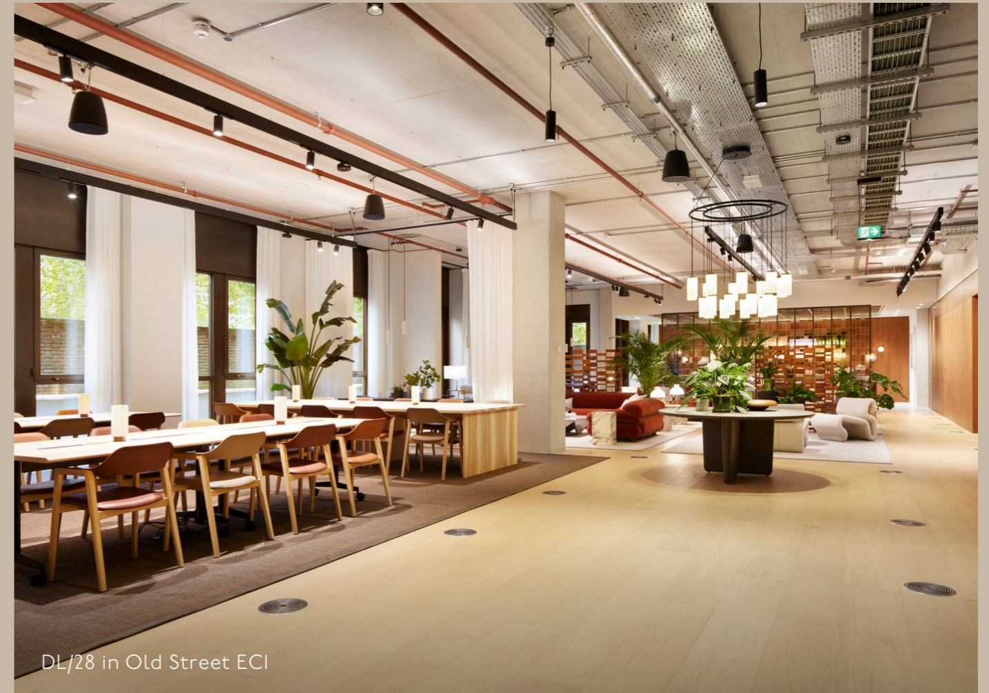
DL/28 in Old Street ECI